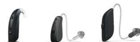
ReSound Hearing Aids

For more information about bimodal hearing, talk to your hearing health care provider.