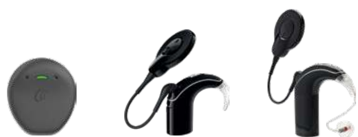
Cochlear™ Nucleus® Sound Processors

In addition to improving speech understanding, the use of a hearing aid and cochlear implant together, rather than using one alone, can help an individual feel 'balanced' between the two ears. 3